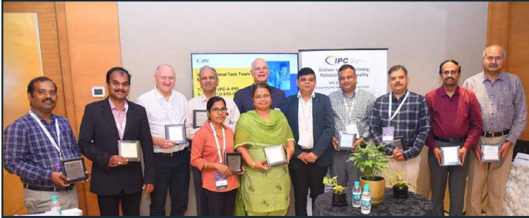
IPC-A- 610 (7-31B-IND) and J-STD 001 (5-22A-IND) India Regional Task Group

Currently IPC India is engaged with 5 Standard Development project teams consisting with 66 volunteers from 57 prominent organizations of India, Sri Lanka and Israel. These team are soon to be expended from volunteers from Missile East, South Africa, Malaysia, Thailand and Saudi Arabia. IPC recognized the efforts from these volunteers for their exemplary efforts and engagement towards industry benefits.