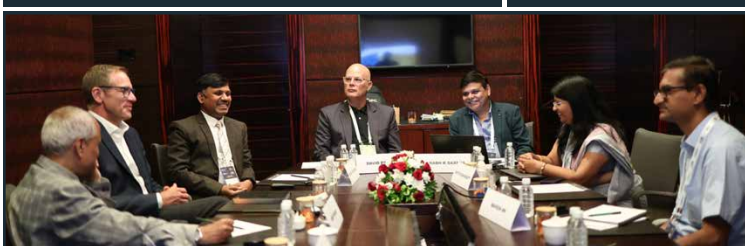
Project Meeting Guideline for Printed Board Design and Manufacturing of IOT Products