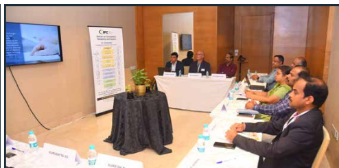
India Regional Task Team Meeting IPC 610 (7-31B-IND), JSTD-001 (5-22A-IND)