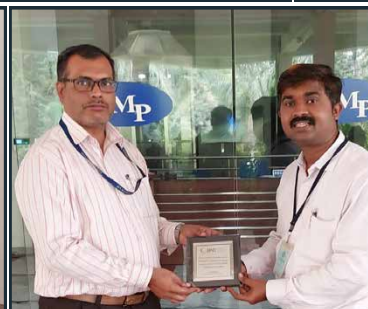
Gurudatta GS Astra Microwave Products Ltd., Bangalore