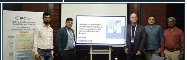
Project Team: Guideline for Automotive Electronics Printed Board Thermal Management & Electronic Component Derating