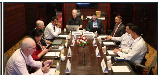
India Regional Task Team Meeting IPC/WHMA 620 (7-31F-IND)